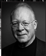
Lynn Harrell Cello Soloist